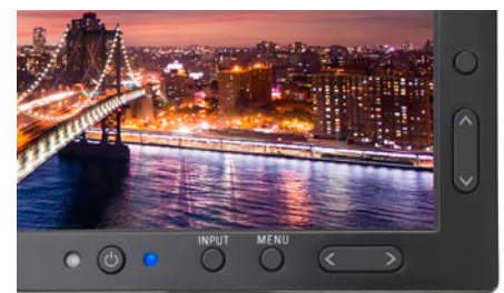
OSD on front