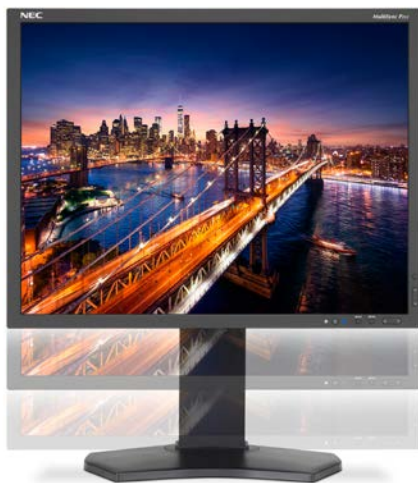
High-adjustable stand with locking base